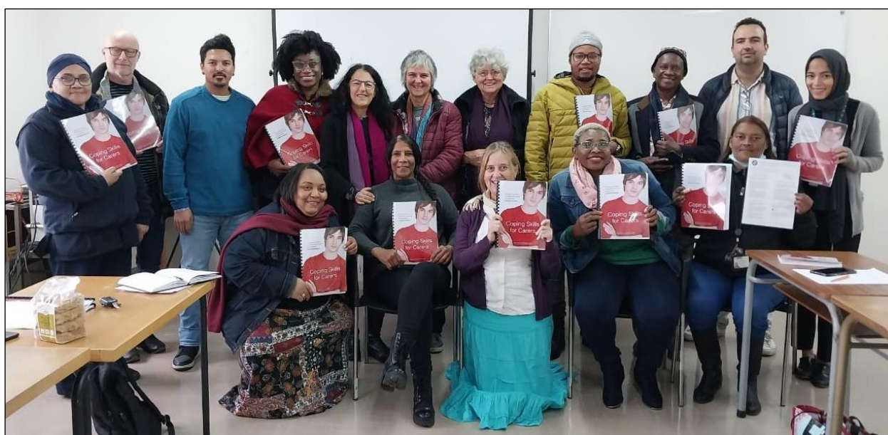
Mental Health Nurses from clinics in two of the Cape Town Metro substructures, psychologists and psychiatrists welcome FSS to their meeting at Valkenberg Psychiatric Hospital and display their copies of Coping Skills for Carers